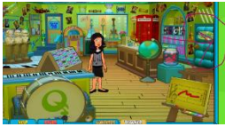
Click on Studio

A fun one to start with is Qgrooves. It is a drag and drop way to compose a song.