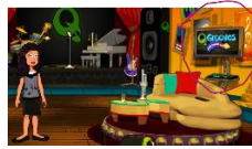
Click on Qgrooves